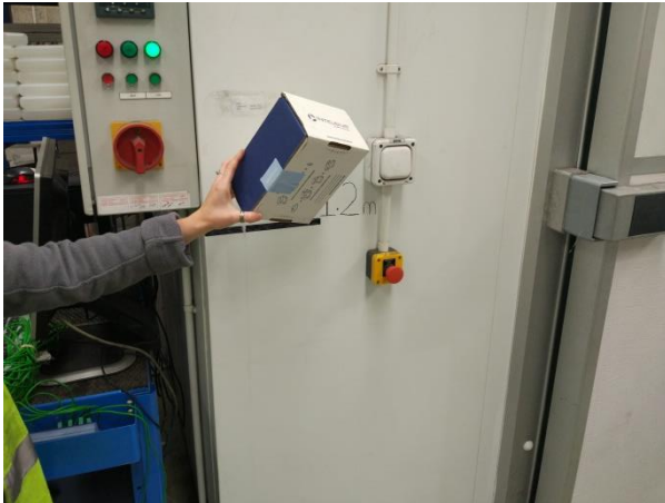
P3 system being dropped