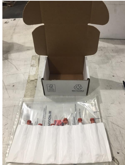
Payload after drop test