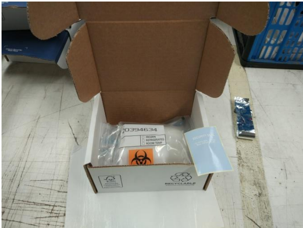
Payload before drop test