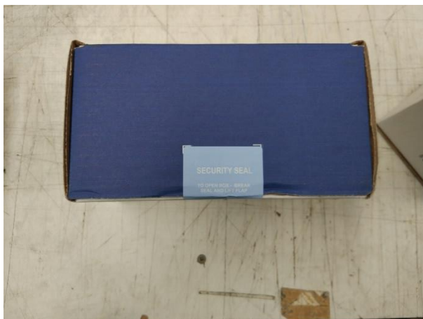
P3 system after drop test