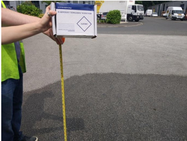
P3 system being dropped after simulated rain