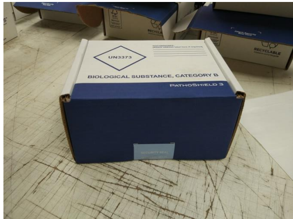
P3 system before drop test