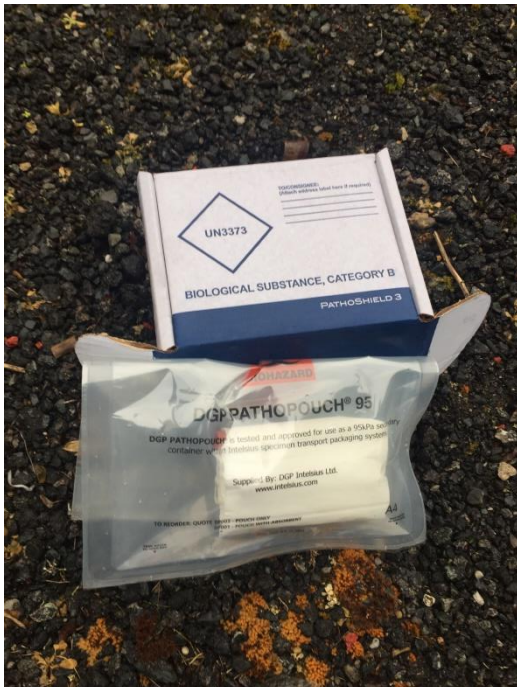
Payload after simulated rain drop test